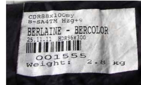
impoTEX barcode label after dyeing and finishing