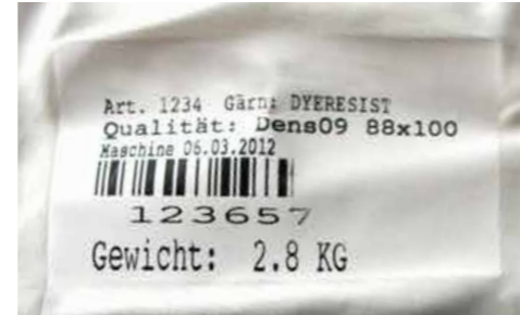
impoTEX barcode label before dyeing and finishing